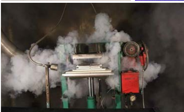
Cell with not controlled dissipation of power