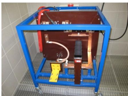
Short circuit equipment, max. current 15 kA / Oven with 200 l volume