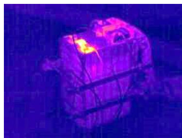
Identification of weakly designed parts of a system