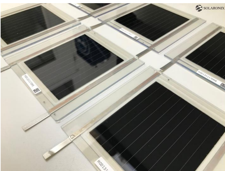
SOLARONIX Perovskite Single Junction Mini-Modules